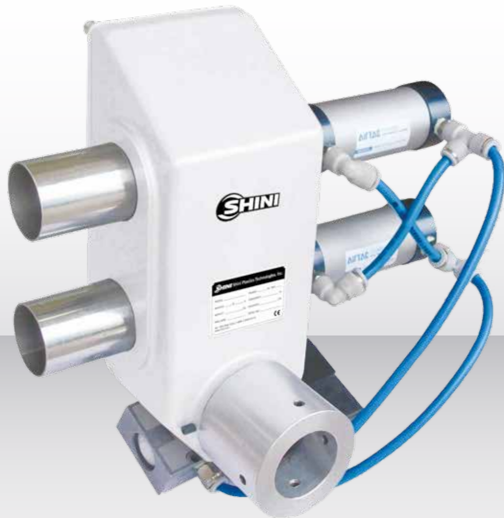
SPV38U e SPV-50U