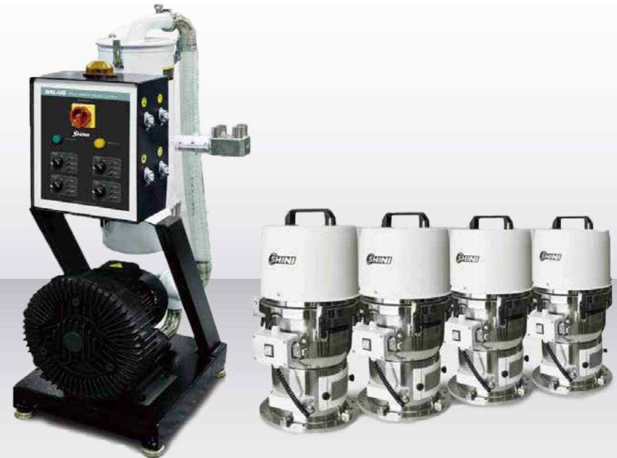
SAL-3.5HP-UG124 & SHR-6U-S