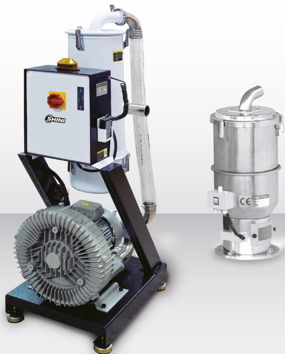
SAL-5HP-UG & SHR-24U